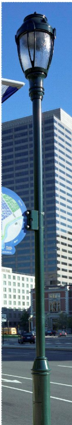
This is what the new pedestrian lighting will look like.

The Pedestrian Lighting Project's number one goal is to enhance safety. Better lighting on sidewalks will make City Avenue even safer